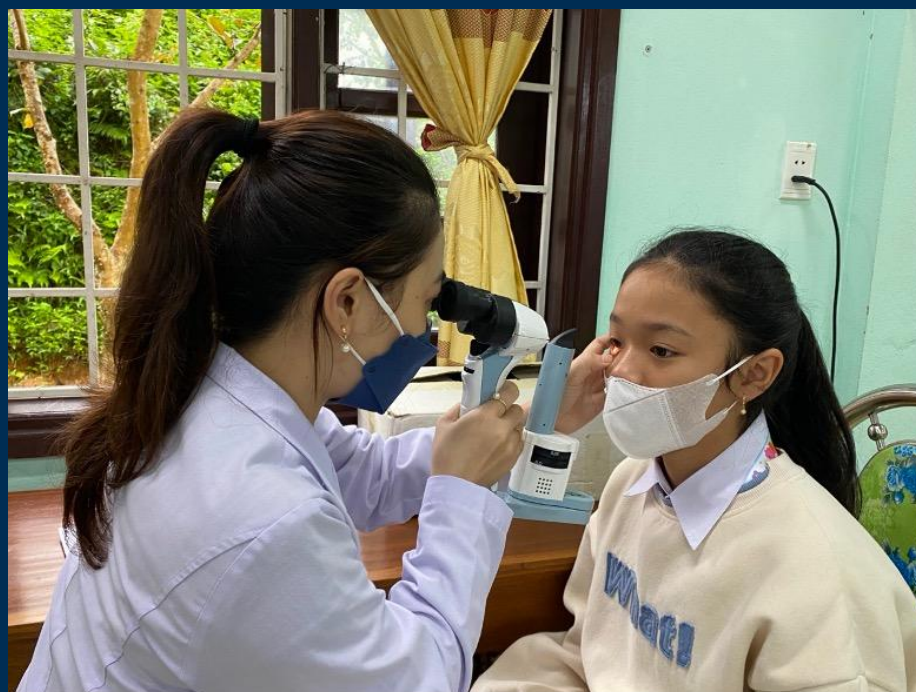
Training for eyecare professionals will be part of program in Nam Dong district.