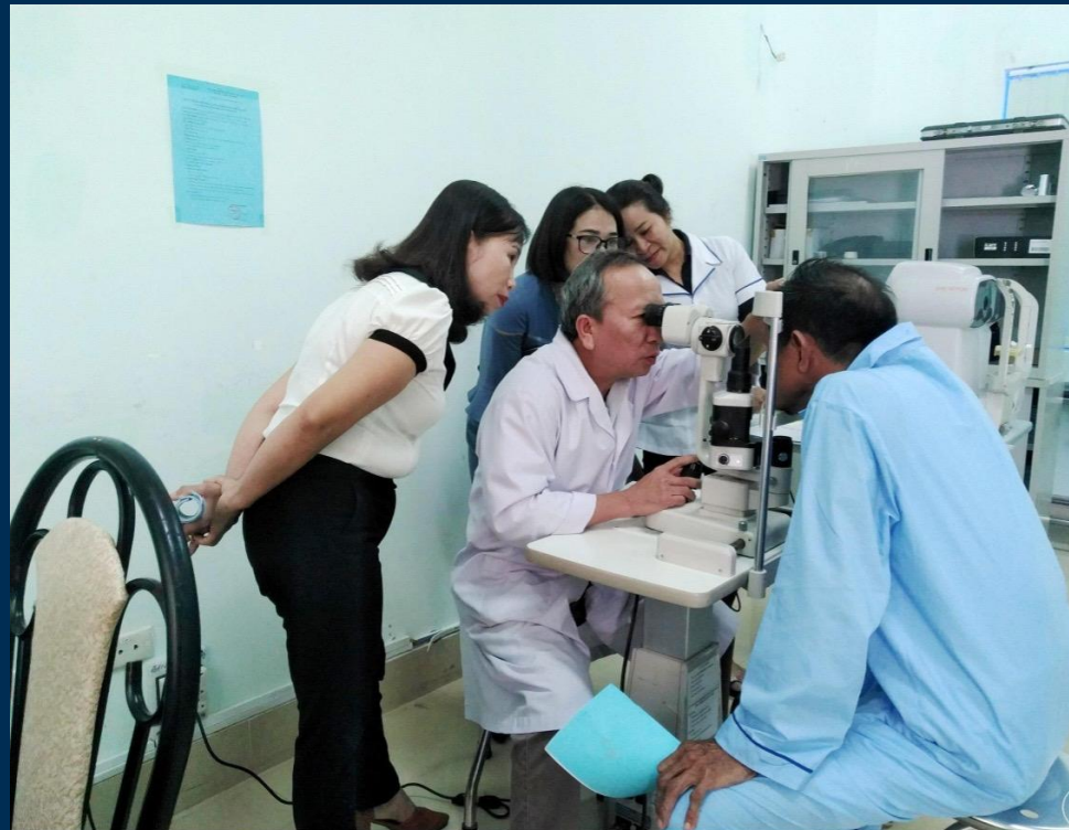
Eyecare clinics in Cam Lo will be used to model facilities in Hai Lang district.